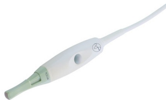
Fig. 1 N11C5s transducer