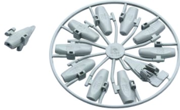
Palette with Needle Guide and Inserts UA1346