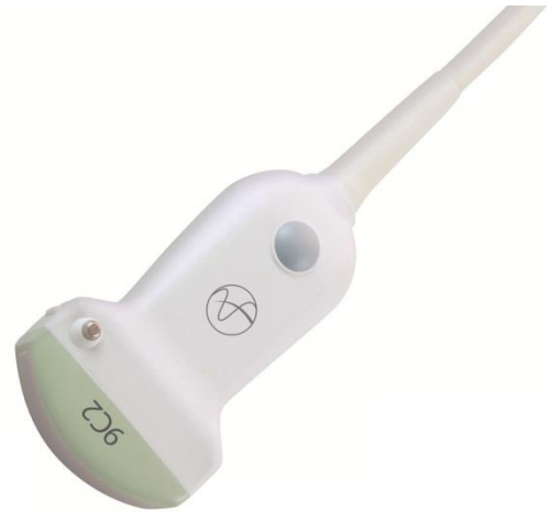
Fig. 1 9C2 transducer