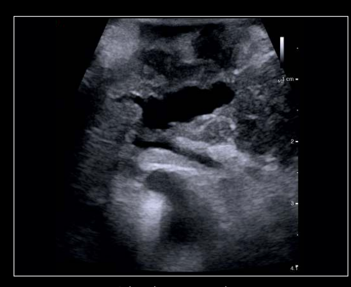
Dilated pancreatic duct I12C5 transducer