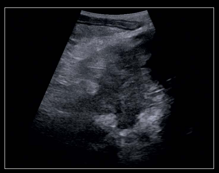
Pancreatic tumor I12C5 transducer