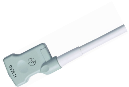
Fig. 1 I12C5b transducer