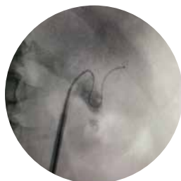
Advancing the ClearPetra sheath over a guide wire

Flexible ureteroscopy and Holmium Laser Lithotripsy with the ClearPetra Ureteral Access Sheath in a patient with renal stones of 20 x 25mm 2