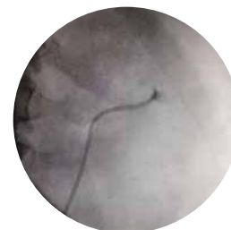
Placement of a Double-J stent after removal of the ClearPetra sheath

If any misunderstanding occurs due to print failure or misunderstanding of the content, Well Lead reserves the right of final explanation.