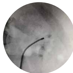
Removing the obturator; commencing lithotripsy using a holmium laser. Stone dust exited the space between the scope and the ClearPetra sheath.